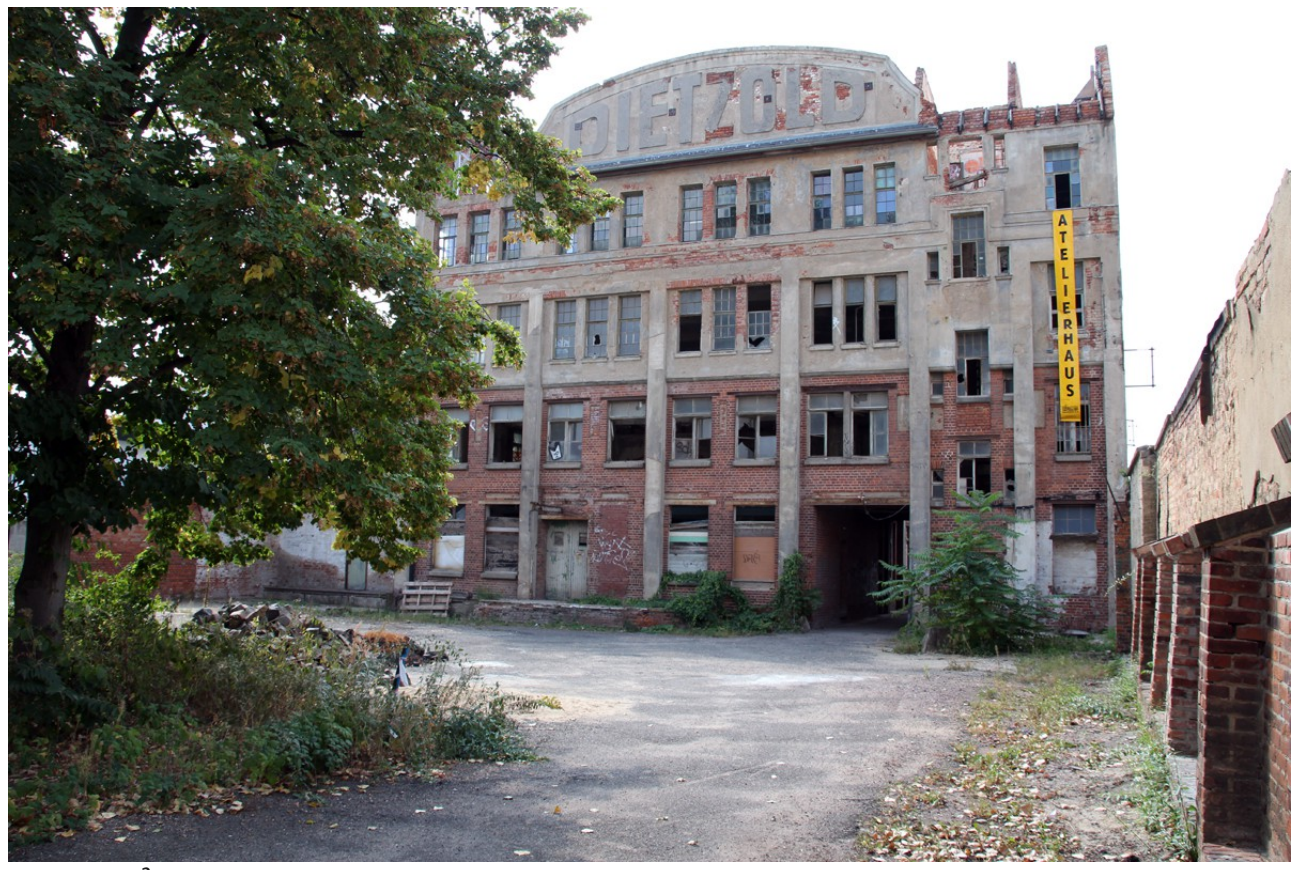
The 465m<sup>2</sup> big studio space at Franz-Flemming-Str. 9, Leipzig

participants with the experience of accomplishing something as a group, and moreover, in experimenting with new forms of cooperation which are vital in fostering an independent position in one's work. This leads to an intensive dialogue about individual ideas and working practices, binding the artists temporarily within the group, which leads to a long-term network that exists even after the residency is over. During each round of the residency, the group of artists can realize and show their projects during our program events.