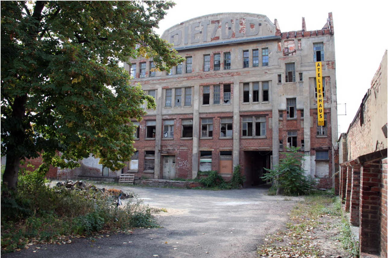
The 465m 2 big studio space at Franz-Flemming-Str. 9, Leipzig

participants with the experience of accomplishing something as a group, and moreover, in experimenting with new forms of cooperation which are vital in fostering an independent position in one's work. This leads to an intensive dialogue about individual ideas and working practices, binding the artists temporarily within the group, which leads to a long-term network that exists even after the residency is over. During each round of the residency, the group of artists can realize and show their projects during our program events.