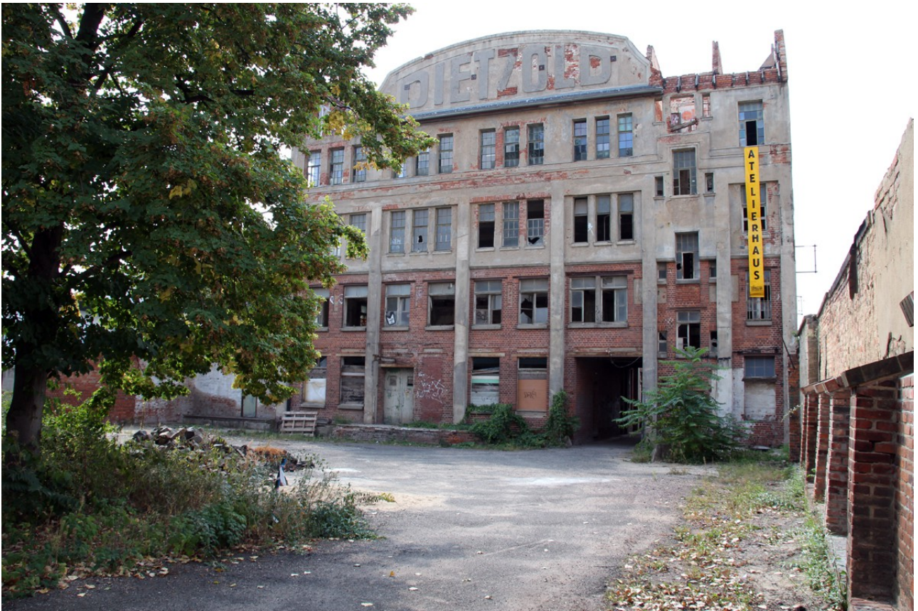
The 465m 2 big studio space at Franz-Flemming-Str. 9, Leipzig