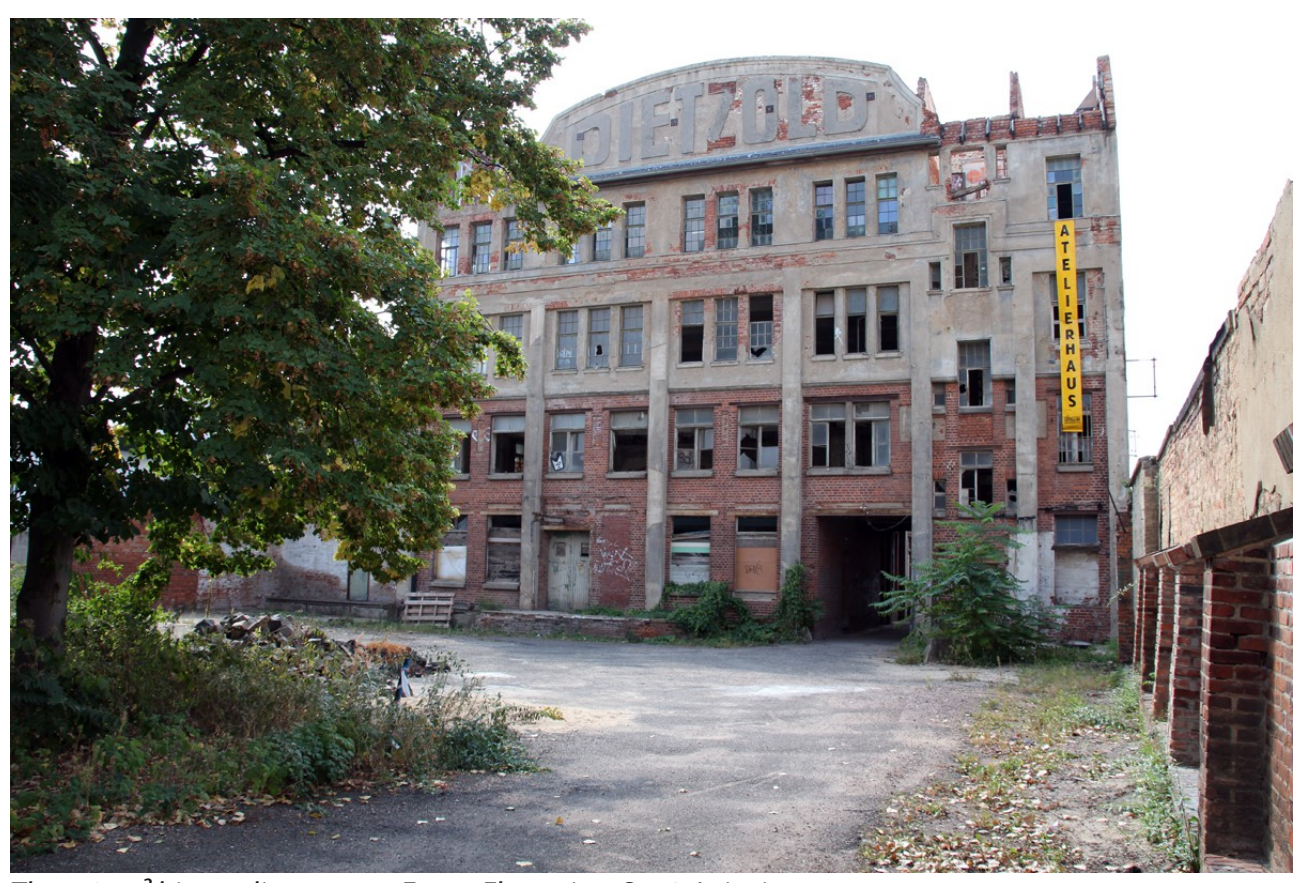
The 465m² big studio space at Franz-Flemming-Str. 9, Leipzig